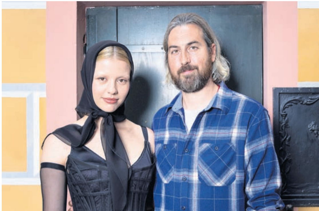
Mia Goth, left, and director Ti West pose for portraits to promote the film "Pearl" during the 79th edition of the Venice Film Festival in Venice, Italy, on Sept. 4, 2022.

"I just had this interest in making, for lack of a bet-